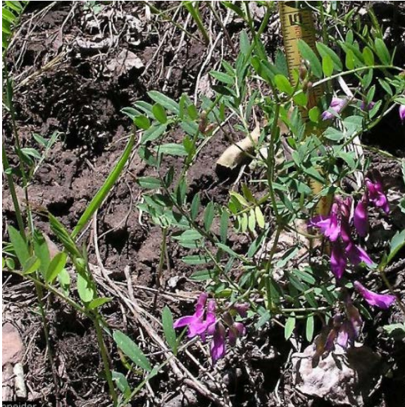
American vetch.

Vicia americana Muhl. ex Willd. Symbol =VIAM