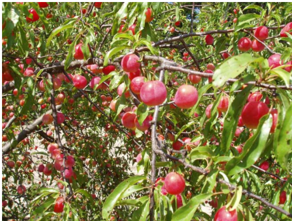
Figure 1. Chickasaw plum in full fruit.