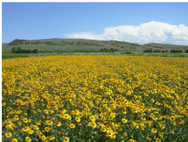
Seed production field in Montana Susan R. Winslow Bridger PMC

cultivation equipment, and ranges from 24 to 36 inches. Adequate between-row space should be provided to perform mechanical cultivation. At 24-inch row spacing, the recommended seeding rate is 2.5 pounds pure live seed/acre, and at 30- and 36-inch row spacing, the seeding rate is 2.2 and 1.9 pounds pure live seed/acre, respectively. There are presently no herbicides specifically labeled to control weeds in seed production fields of this species. Seed harvest can be accomplished by direct combining when the seeds have just begun to shatter from the radiate flower head. Immediately after combining, spread out harvested material to dry and prevent mold. Due to the persistent hairy pappus, and poor seed flow, this species is fairly difficult to clean. Seeds are moderately viable and longevity can be expected for several years when stored at favorable temperatures and low humidity. Meriwether Germplasm blanketflower yielded approximately 150 bulk pounds of seed per acre in experimental irrigated plots at the Bridger Plant Materials Center (BPMC) on an average harvest date of July 29. Seed production is expected to be much higher when grown under conventional agronomic conditions.