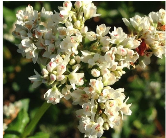
Buckwheat flowers. Pamela Pavek, NRCS.

Wildlife habitat: Buckwheat is sometimes an ingredient in birdseed mixes and planted with other crops for wildlife food plots (Oplinger et al., 1989).