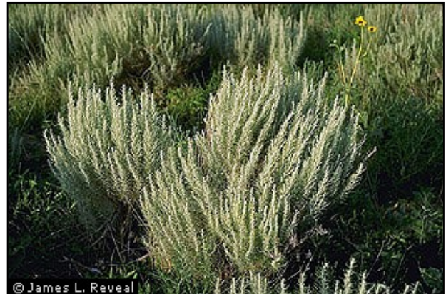
Figure 1 California Sagebrush.

California sagebrush is adapted to summer heat and drought, dropping its leaves only under periods of extreme drought stress (Perry, 1981). The root system is shallow and fibrous, allowing the plant to take advantage of early season rains for rapid