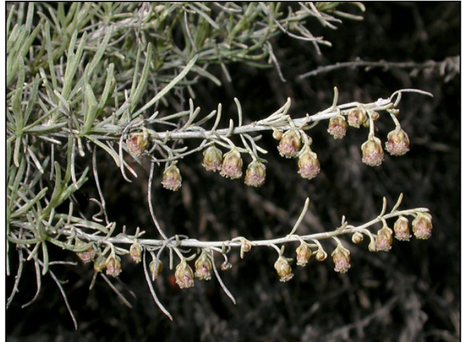
Figure 3. Flower structures and inflorescence form on California sagebrush, Artemisia californica .

Germination occurs in 21–30 days at 73.4°F (23°C) in light, and no seed treatment is required. Germination rates are generally