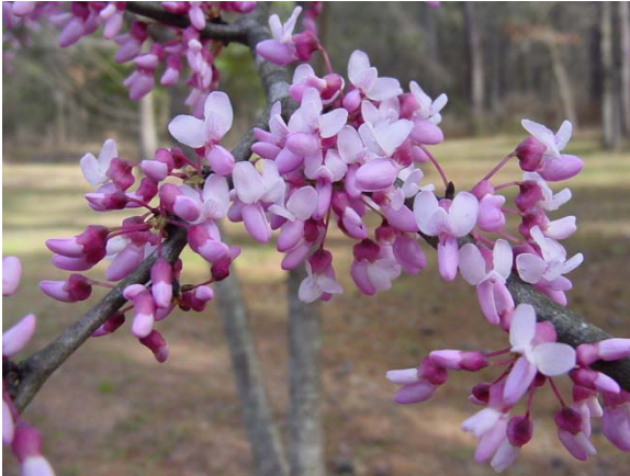
Melinda Brakie-USDA NRCS Plant Materials

Contributed by: USDA NRCS East Texas Plant Materials Center.